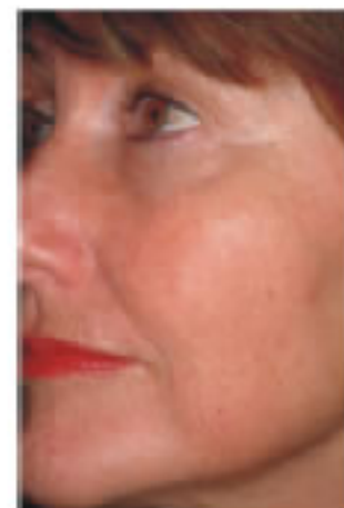
Starlux Post 4 treatments