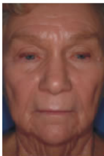
10 years Post 1 treatment, 84 year old