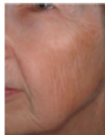
Gentle:YAG Post 4 treatments

Call our office for a consultation at 795-7729 or visit our website at www.pimaderm.com to learn more!