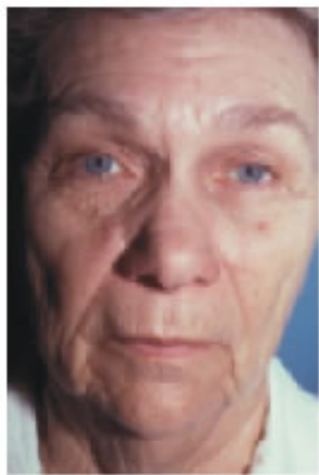
Laser Resurfacing Pre-treatment of 74 year old